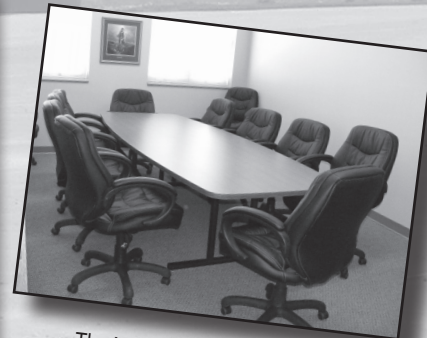
The Young Conference Room