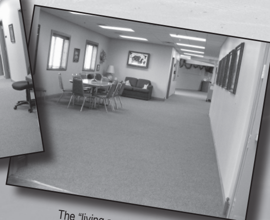
The "living room"