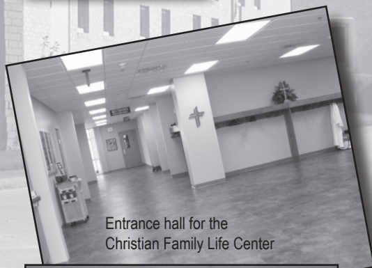
Entrance hall for the Christian Family Life Center