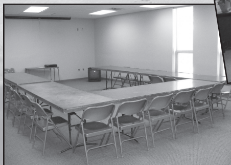
St. Matthew Room