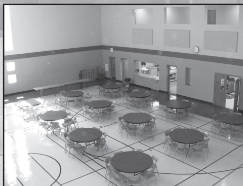
New Fellowship Hall