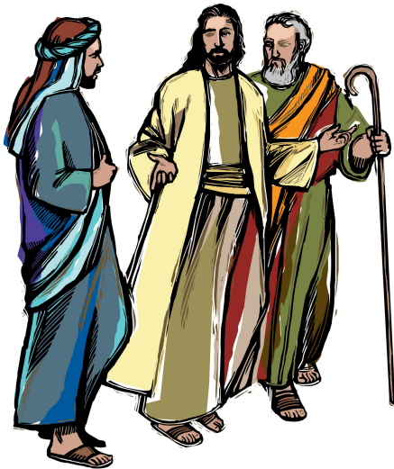
On the Road to Emmaus