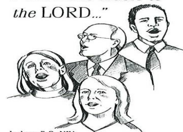
Judges 5:3, NIV

“I will sing to the LORD, I will sing; I will make music to the LORD...”