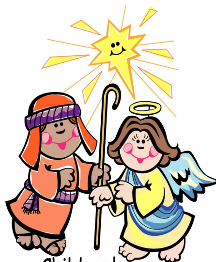
Children's Christmas Program